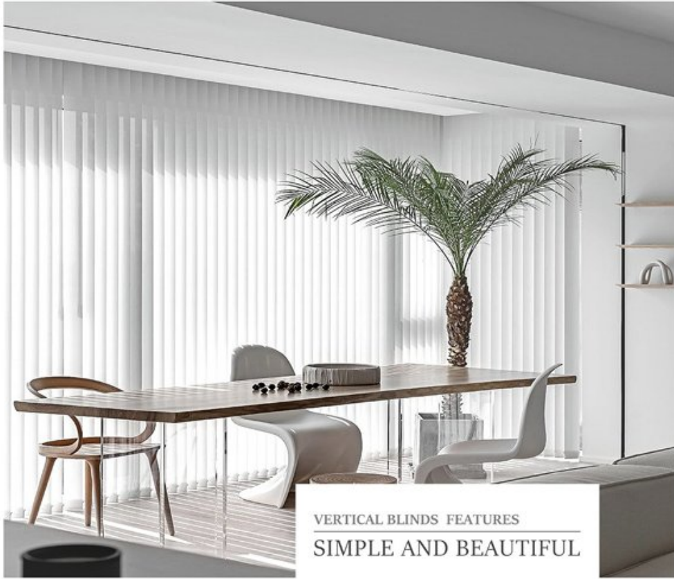
VERTICAL BLINDS FEATURES SIMPLE AND BEAUTIFUL