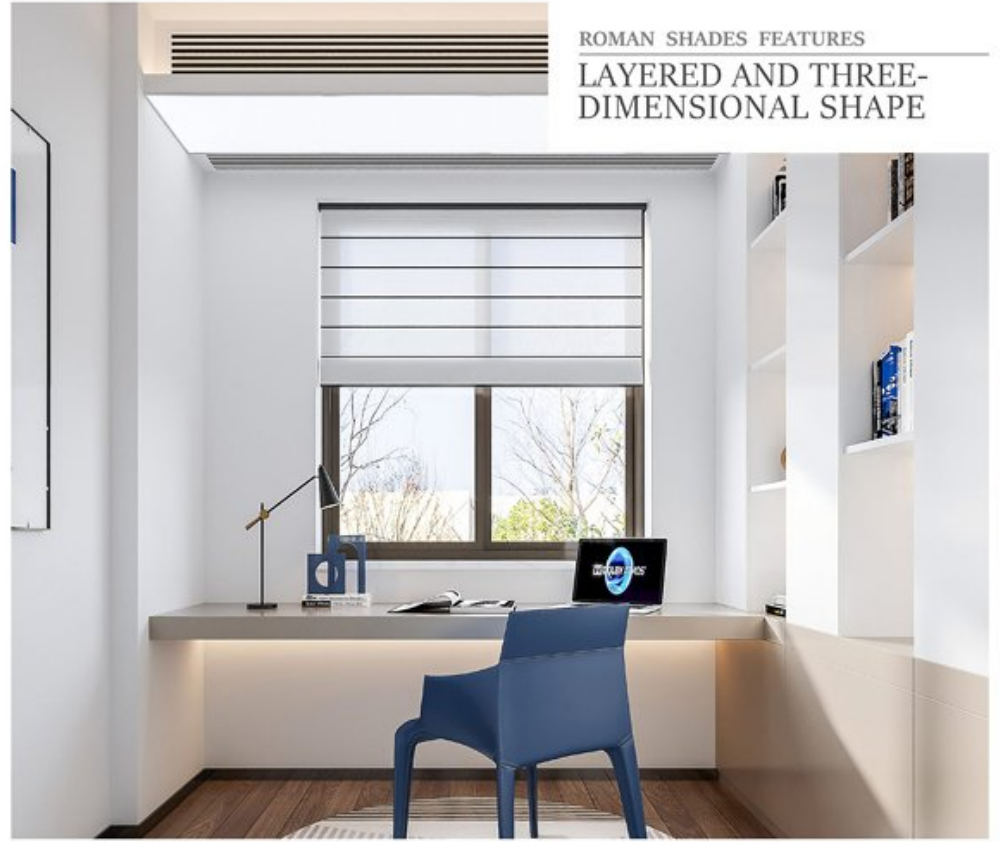
ROMAN SHADES FEATURES LAYERED AND THREE- DIMENSIONAL SHAPE