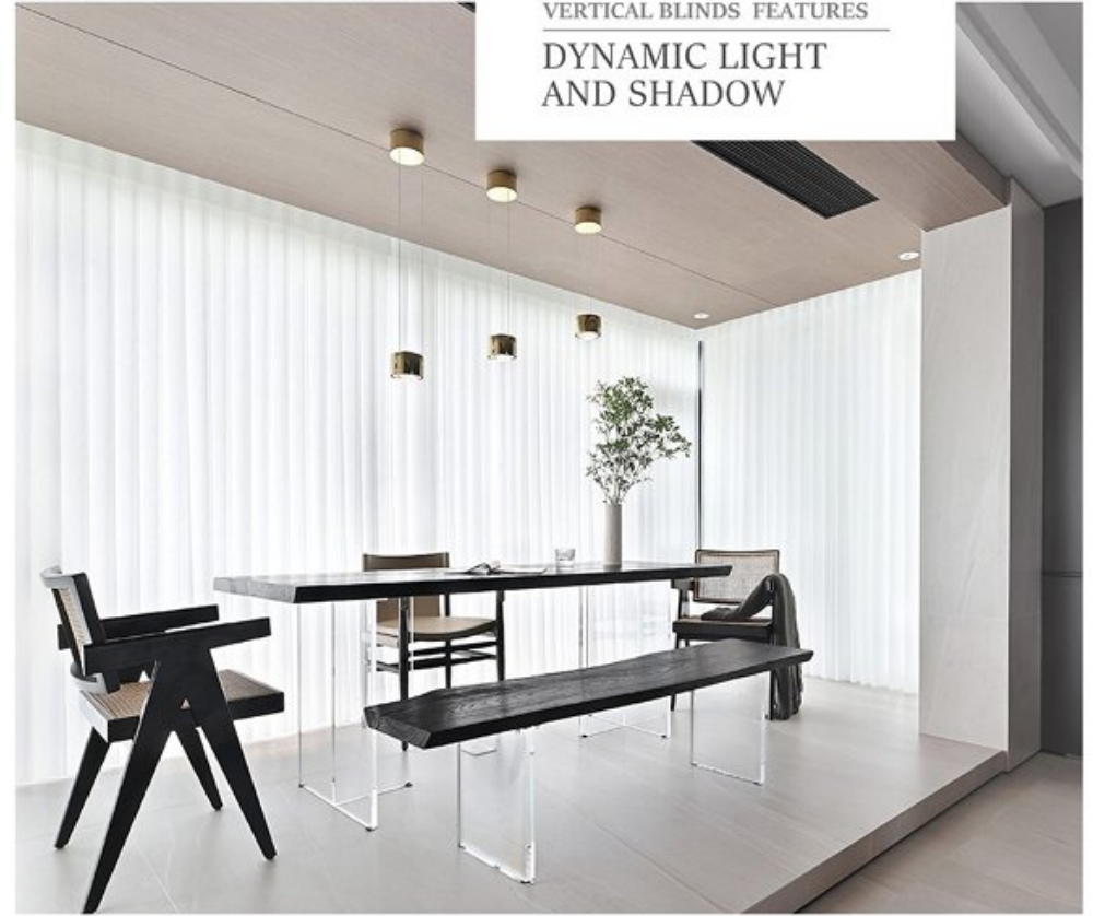
VERTICAL BLINDS FEATURES DYNAMIC LIGHT AND SHADOW