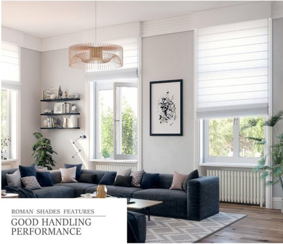
ROMAN SHADES FEATURES GOOD HANDLING PERFORMANCE